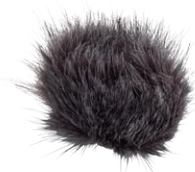
WSU-4 Hairy Windscreen