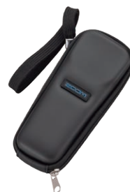
Padded Shell Case

The APH-1e gives creators all of the essential accessories needed for their Zoom H1essential Handy Recorder.